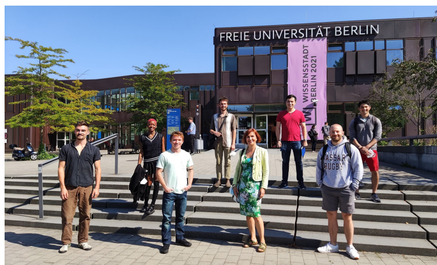
Berlin Consortium for German Studies, Autumn 2021 (Germany)

Participation in UChicago Study Abroad programs may help you learn a new language or continue studying a language you already know—with the possibility of gaining significant proficiency levels. Visit languageassessment.uchicago.edu/flpc for information about the Office of Language Assessment's Foreign Language Proficiency Certifications (FLPCs). Engagement with both Study Abroad and FLPCs will earn points toward Global Honors, the College's recognition of exceptional global engagement. For more information, visit languages.uchicago.edu/global-honors .