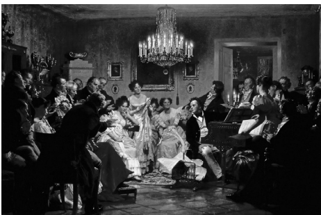
Franz Schubert at the piano. ( Schubertiade , Julius Schmid, 1897)

The program opens with an early Sonata in B-flat Major by Mozart that illustrates wonderfully the appeal of the four-hand configuration. Composed when he was just 18 years old, Mozart certainly would have first played the work with his sister Nannerl who would take the upper (primo) part and himself playing the lower (secondo) part. (It was one of four sonatas that he composed in this medium.) The animated dialogue between the two players in which Mozart's exquisite melodies are traded off is a typical feature of the early piano duet. At the same time, the sonata conveys beautifully the sense of sociability and friendship that was an important appeal to performers.