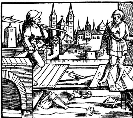
Woodcut of Till Eulenspiegel from 1515.

Caplet's brilliant arrangement illustrates some of the ways a skilled piano arranger can compensate for its loss of color. Borrowing techniques of pianism pioneered by Liszt in many of his own arrangements and fantasies of symphonic and operatic music, Caplet writes out gossamer-like piano figurations and tremolos for the pianists to play shaped by subtle dynamic shadings, pedal fluttering, and judicious use of the sustain and una corda pedals. All of these are pianistic techniques that can help the pianists to convey – or perhaps, to conjure – orchestral sounds in the ears of listeners.