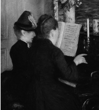
La leçon de piano, Gustave Caillebotte, 1881.

If the piano duet became a favored medium of sociability and Bildung for a growing class of bourgeois amateur musicians in the nineteenth century, there was another catalyst for the four-hand configuration that is perhaps less well recognized today. It became a means by which generations of pianists gained musical literacy by playing through the endless number of arrangements of concert, operatic, and chamber music that were transcribed for two players sitting at the same keyboard. It is hard to exaggerate the importance of the four-hand transcription in this regard. There is scarcely any concert or stage music from the long nineteenth century that was not churned out for a growing public of amateur pianists in the guise of these duet arrangements. By 1860, one trade journal inventoried over 60,000 differing four-hand transcriptions in print – and that is just for German-speaking lands!