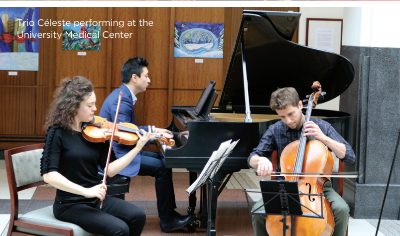
Trio Céleste performing at the University Medical Center