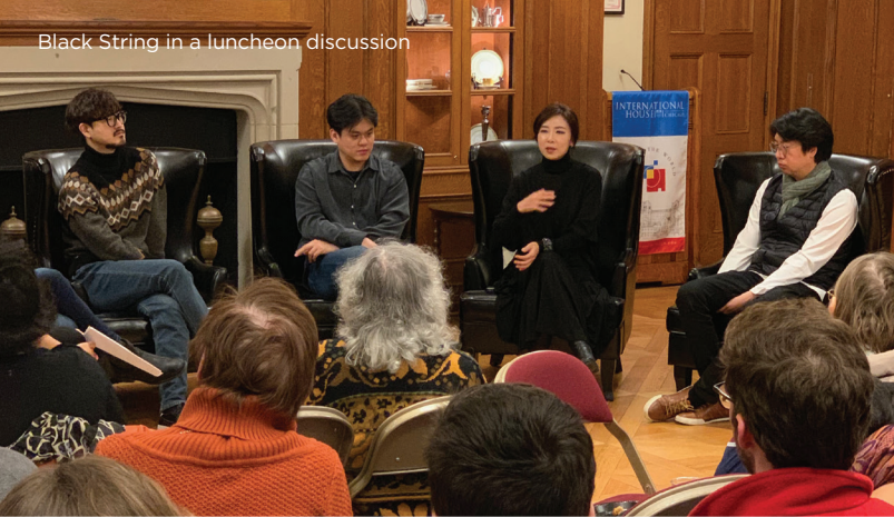
Black String in a luncheon discussion