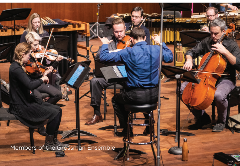
Members of the Grossman Ensemble