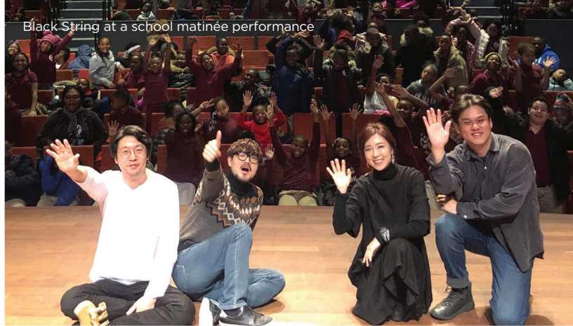
Black String at a school matinee performance